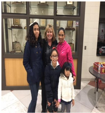
SIS Student vs. Faculty Basketball Game