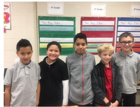
Grade 4 Cooperative Learning