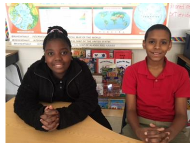
Learning together is fun in Grade 6