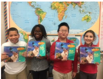
Grade 5 Working Together