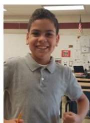
Let it Snow