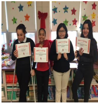
Congratulations to our Gr. 6 Honor Roll Students