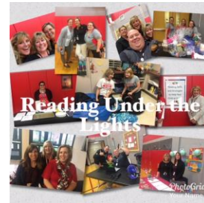
Reading Under the Lights